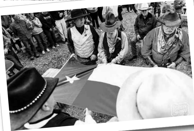
HALLOWED GROUND...ANNUAL TEXAS FLAG RETIREMENT CEREMONY IN LUCKENBACH