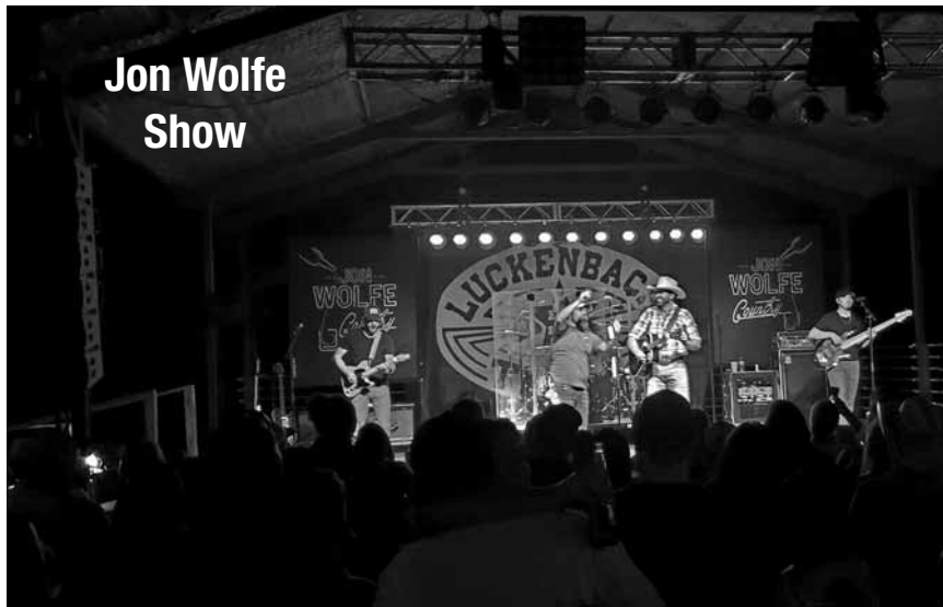
Jon Wolfe Show