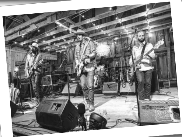
BAND OF HEATHENS