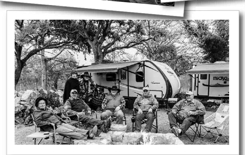
IRREGULARS - HARD LIVIN' IN LUCKENBACH